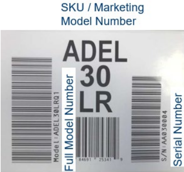
Carton Barcode Label