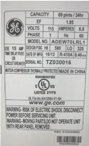
On Product Label